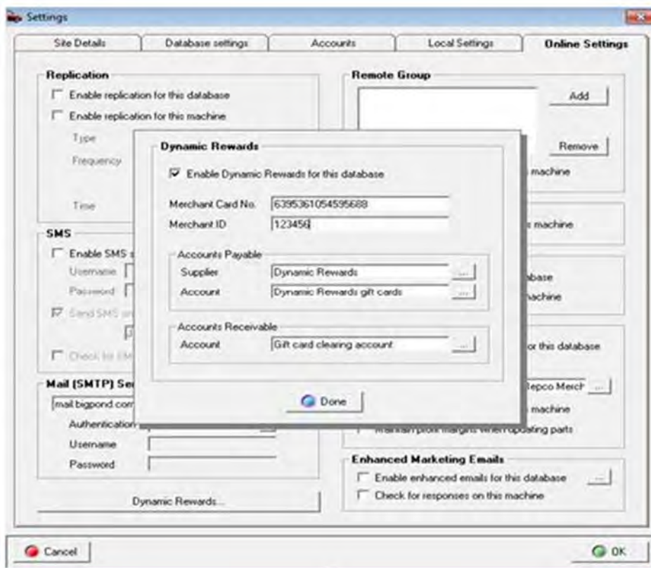
Fig 14.30 Dynamic Rewards Settings.

Once you have completed the details select done, save your changes by clicking on OK (F11). Your database is now set to transact with Dynamic Rewards providing you have an internet connection.